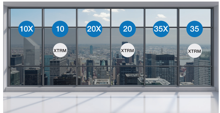
DR Grey 10X | DR Grey 10 XTRM | DR Grey 20X | DR Grey 20 XTRM | DR Grey 35X | DR Grey 35 XTRM