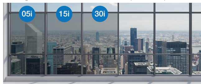
NT Natura 05i | NT Natura 15i | NT Natura 30i

This image has been simulated and is not actual product comparison