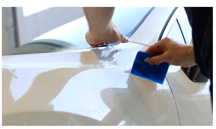
Work from the middle towards the outside edges of the panel, ensuring no slip solution or small air bubbles remain under the film.

Important Note : Re-positioning of the film is only possible during the initial positioning and after low squeegee pressure has been applied to the film. If done at a later stage small marks or lines might remain visible in the film surface.