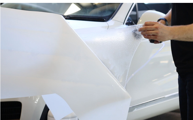
Once the material has been positioned, gently start to squeegee the film.