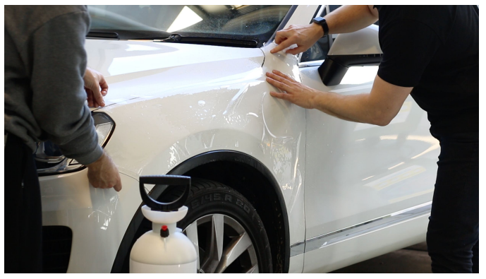
Using the PPF Squeegee Pro Rigid (Blue) or PPF Squeegee Pro Flex (Red), start in the middle of the panel and gradually increase the pressure in order to remove all the air and slip solution from under the film. Overlap the squeegee strokes by about 50% to avoid remaining air/water entrapment.