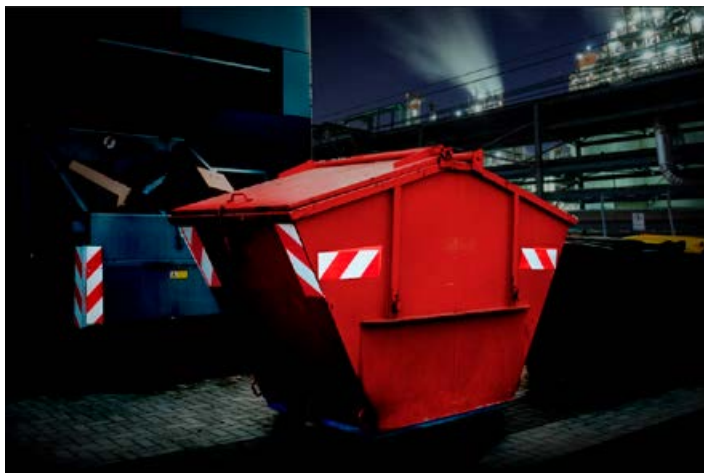
Avery Dennison Chevron White/Red used for container hazard marking.

* Note that special permission is required to use fluorescent yellow/red hazard marking on emergency vehicles.