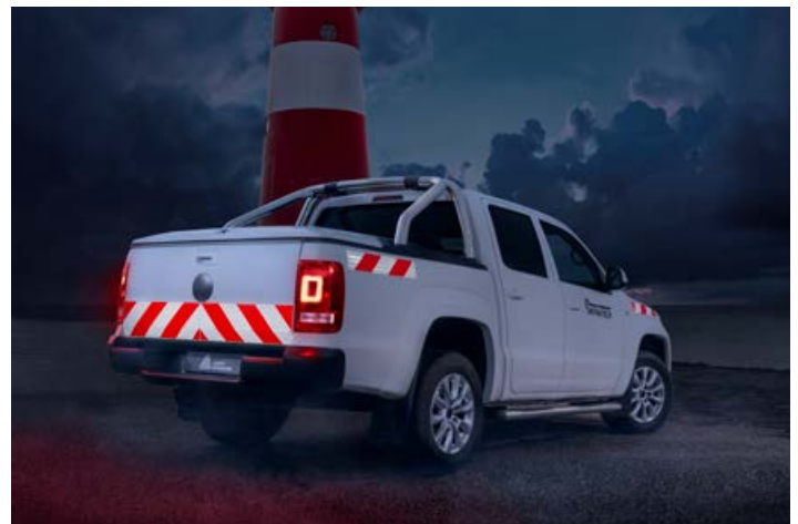
Avery Dennison Chevron White/Red used for vehicle marking according to DIN30710 and TPESC-B.