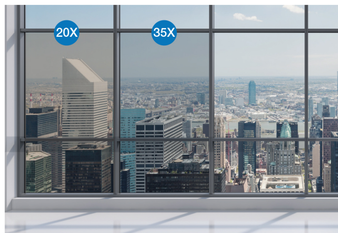
DS Bronze 20X

This image has been simulated and is not actual product comparison